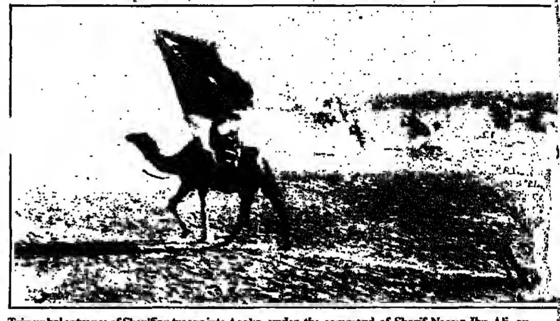
Triumphal entrance of Sharifian troops into Aqaba, under the command of Sharif Nasser Ibn Ali, on July 6, 1917.